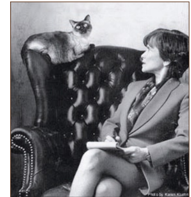
THE FOUNDING MOTHER OF CAT PSYCHOLOGY